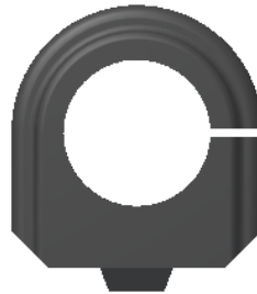
2 Per Vehicle